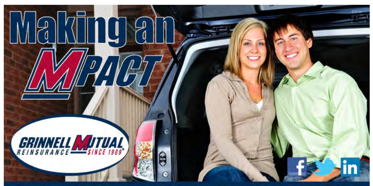
Partnering with our member mutuals to protect families for generations. Find more information at grinnellmutual.com.

The board will hold their final quarterly meeting at the MAFMIC office in St. Joseph on December 18-19. Members are encouraged to contact their MAFMIC District Directors with any concerns or issues that may need to come before the board.